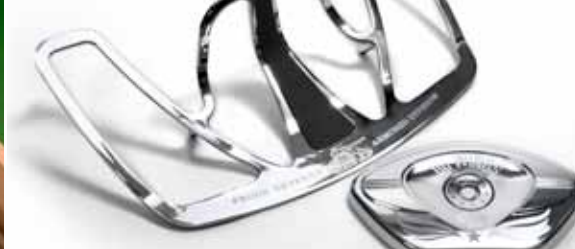
Chrome motorcycle accents