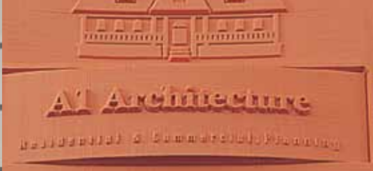
Elegant corporate ID signs