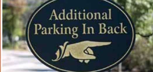
Retail & directional signs