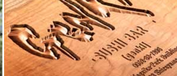
Routed wooden signs

Power, precision and performance come standard. Roland EGX Pro engraving machines have the power, size and speed professional engravers want. In addition to customizing awards, plaques, name plates, apparel and promotional items, these benchtop devices are perfect for producing quality indoor and ADA-compliant signage. Your braille and pictographic signs will have an upscale look while meeting all ADA regulations.