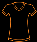
SPORTSWEAR & APPAREL

Developed specifically for dye-sublimation transfer printing, the Texart XT-640 is an unstoppable machine that delivers outstanding print quality on long print runs, day-after-day. By combining Roland DG reliability with the latest print technology, users can quickly and effortlessly create high-volume sportswear, fashion, soft signage, interior decoration, promotional merchandise and much more.