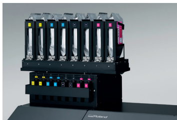
Roland Ink System.