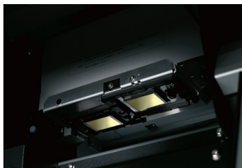
Dual print heads in staggered formation.