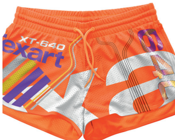
Orange and violet for vivid printing. Black ink for details and opacity. Light cyan and light magenta for smooth gradations.